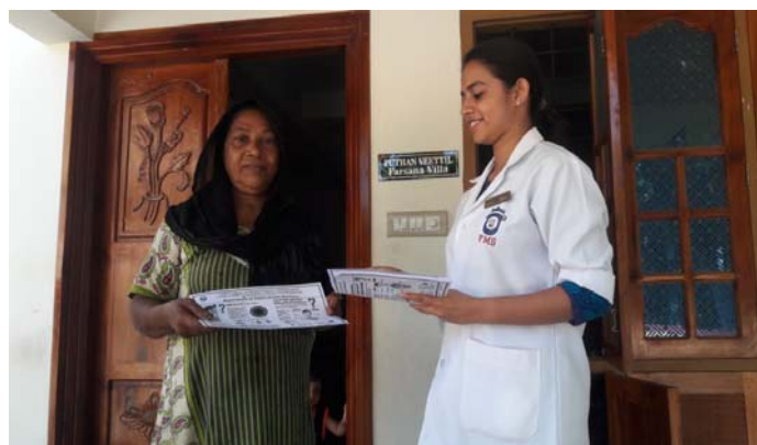
COVID – 19 - Precautionary Measures taken by PMS