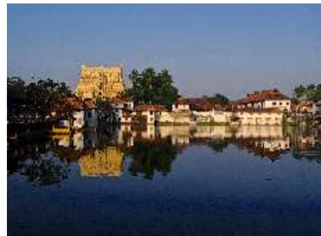
Sree Padmanabha Swamy Temple