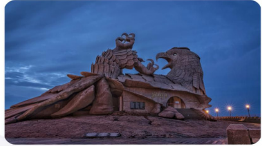
Jatayu Nature Park