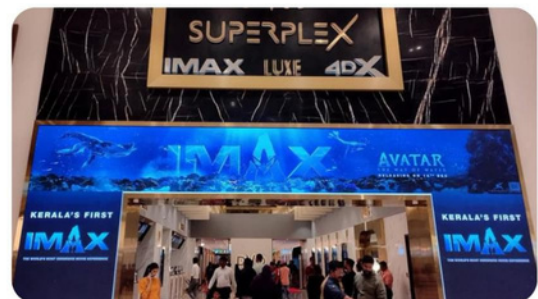
IMAX, Lulu Mall