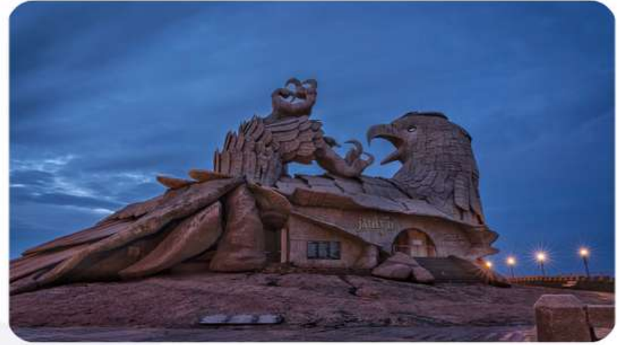
Jatayu Nature Park