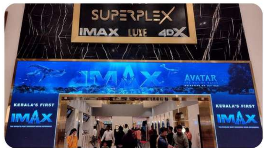
IMAX, Lulu Mall